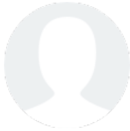
Melanie Bobby Century 21 Northern Advantage