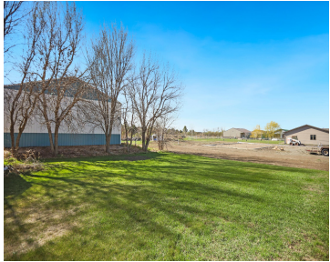
13275 373rd Ave, Ipswich, SD 57451